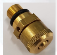
Luise Safety Valve